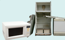
Household appliances and metals