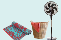
Large household items