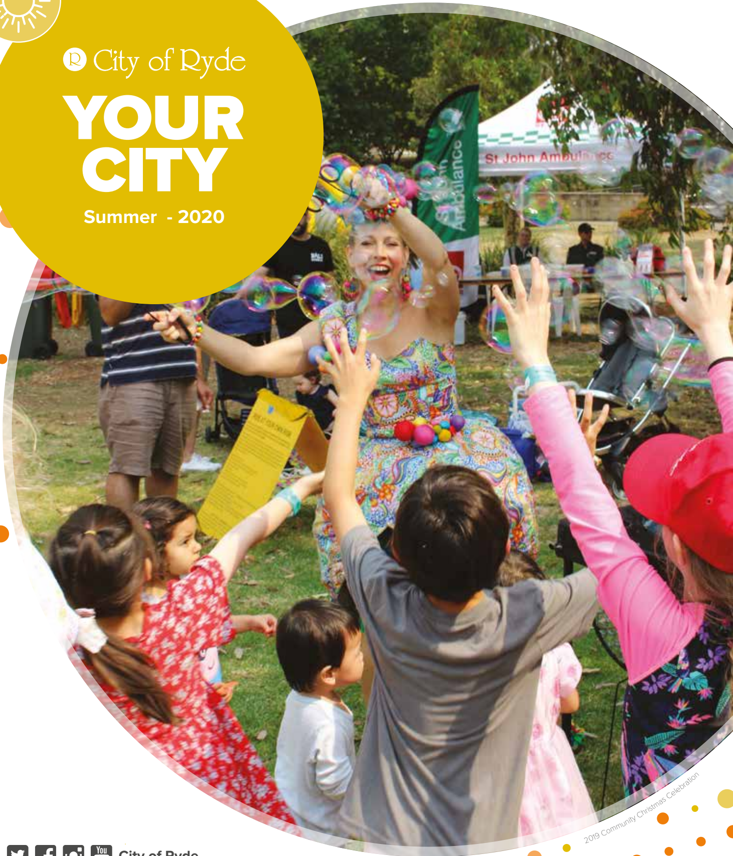
2019 Community Christmas Celebration