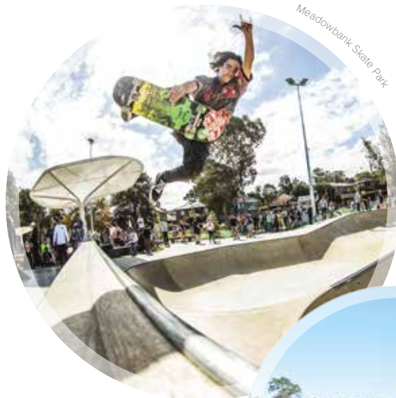
Meadowbank Skate Park