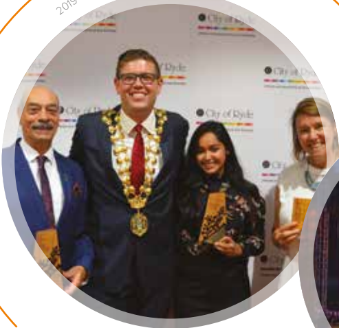
2019 Citizen of the Year Award Winners

For more information, visit www.ryde.nsw.gov.au/easterparade