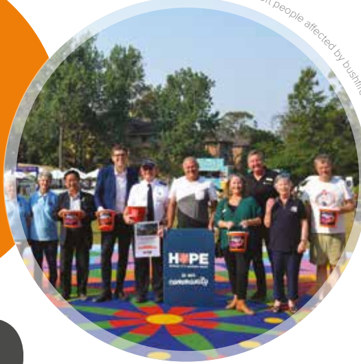
Raising funds to support people affected by bushfires and drought