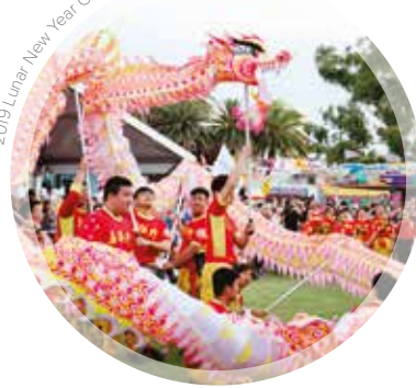
2019 Lunar New Year Grand Celebration

Our events cater to our diverse community and take place throughout the year. There's something for everyone.