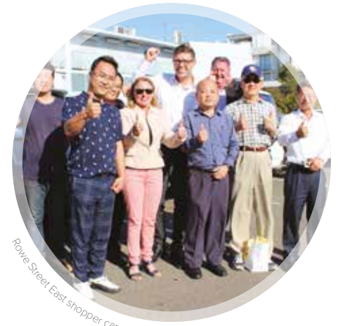
Rowe Street East shopper car park

The final design for the missing link is based on extensive consultation with key stakeholders and ensures none of the boardwalk will be built on private land.