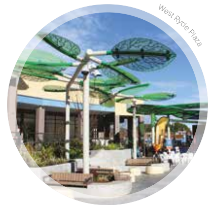
West Ryde Plaza

Key projects delivered by the City of Ryde include: