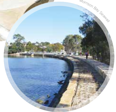
Morrison Bay Seawall