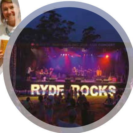
2019 Australia Day

For more information, visit www.ryde.nsw.gov.au/citizen