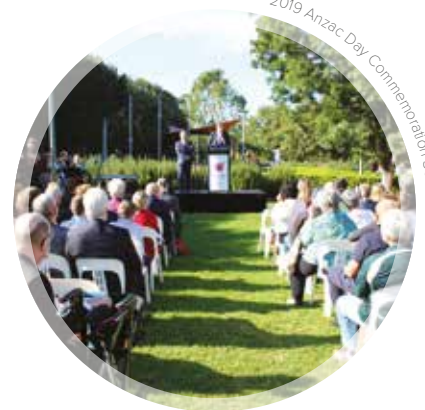
2019 Anzac Day Commemorative Service

For more information, visit www.ryde.nsw.gov.au/australiaday