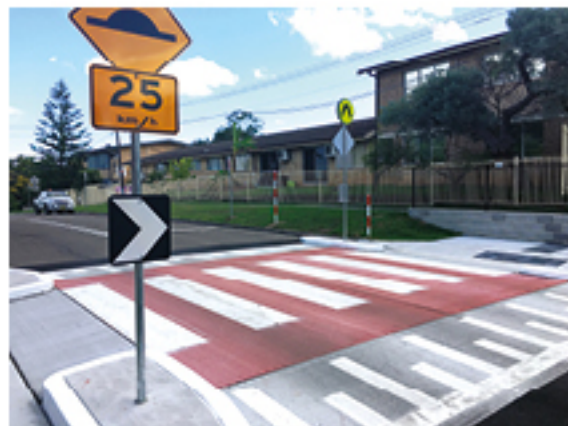
The crossing will be similar to the one built on Oxford Street Gladesville (above)