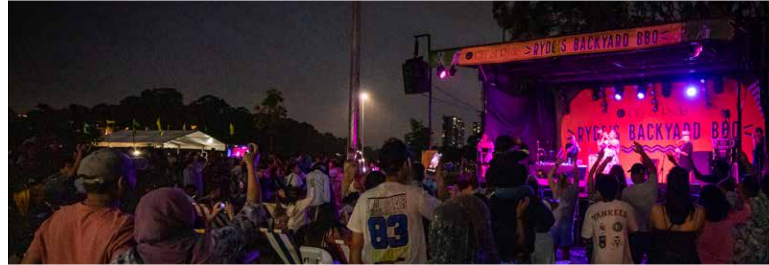
Late night: 12am – 6am