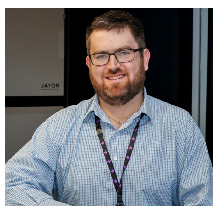
Page 4 CITY OF RYDE LIVE. WORK. PLAY MAGAZINE

If you're not sure if your item qualifies, check the website below or give the CRC a quick call at 9936 8100. Learn more about the trial by visiting www.ryde.nsw.gov.au/CRC