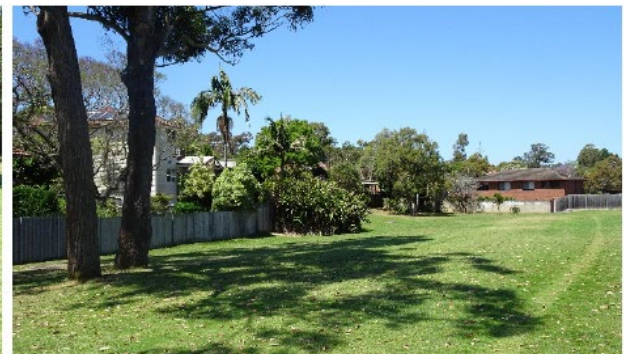
Image 8: North-eastern side of Gannan Park – proposed area for recategorisation