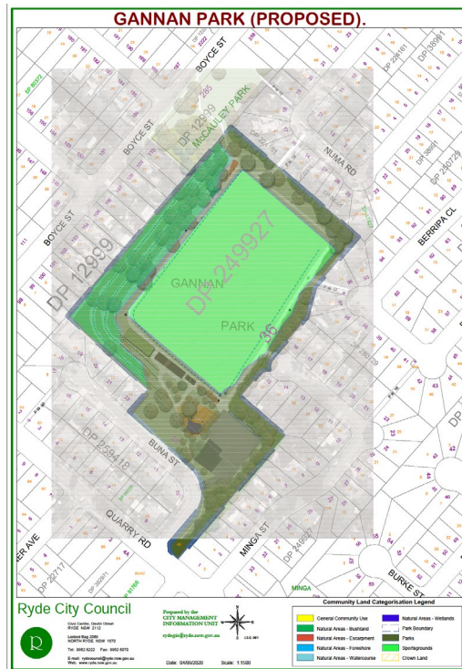
Image 4: Gannan Park - Proposed community land categorisation overlaid with the adopted Masterplan