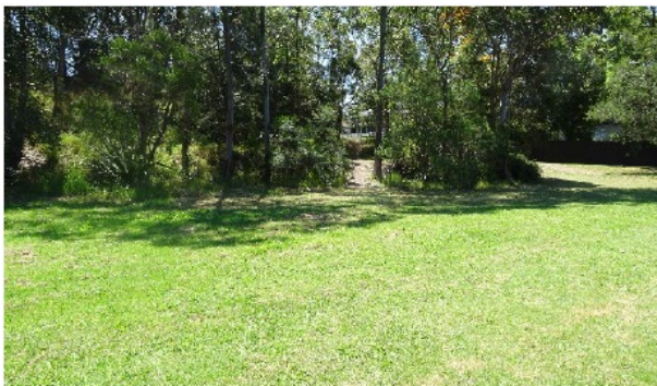
Image 7: Northern side of Gannan Park (near McCauley Park) proposed area for recategorisation