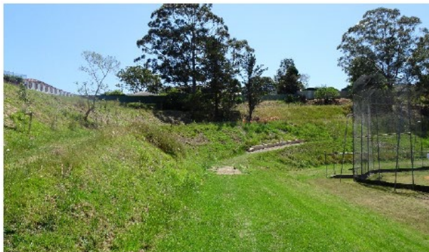
Image 5: South-western side of Gannan Park proposed area for recategorisation