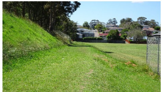
Image 6: North-western side of Gannan Park – proposed area for recategorisation