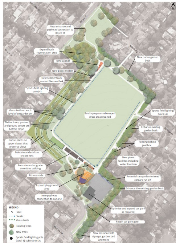
Image 1: Gannan Park and McCauley Park Masterplan (adopted July 2019)