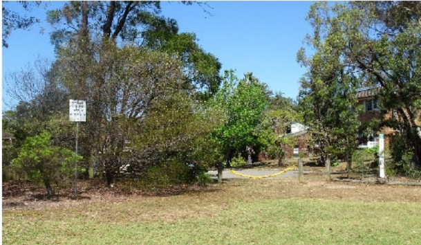
Image 9: Eastern side of Gannan Park (near Minga Street entry) proposed area for recategorisation

The land recategorisations of parts of Gannan Park as recommended in this report, will provide alignment with current and future park uses as per the adopted Masterplan. In particular, the land recategorisation will ensure consistency with the following elements of the Masterplan once implemented: